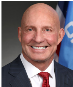
SENATOR DARRELL WEAVER