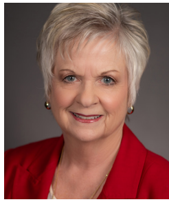
SENATOR JULIE DANIELS