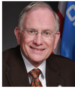
SENATOR TOM DUGGER