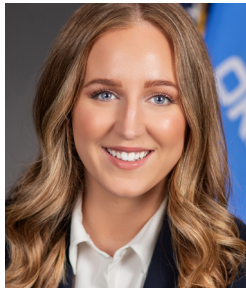
SENATOR ALLY SEIFRIED