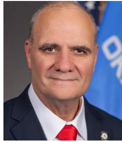
SENATOR DANA PRIETO