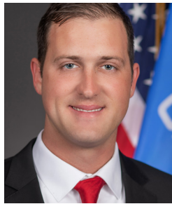
SENATOR TOM WOODS