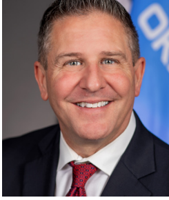
SENATOR TODD GOLLIHARE