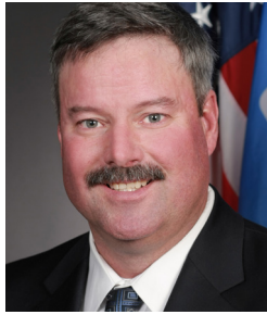
SENATOR CASEY MURDOCK