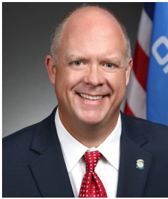
REPRESENTATIVE PRESTON STINSON