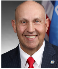
SENATOR DEWAYNE PEMBERTON