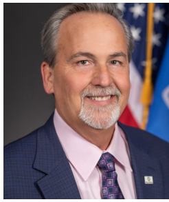
SENATOR BILL COLEMAN