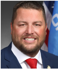
SENATOR CODY ROGERS