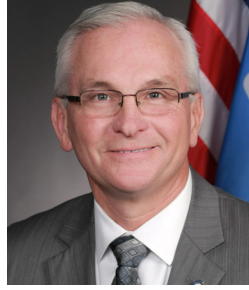
SENATOR DARCY JECH