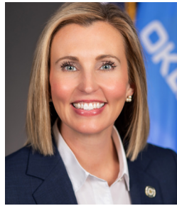
SENATOR KRISTEN THOMPSON