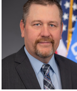
SENATOR GRANT GREEN