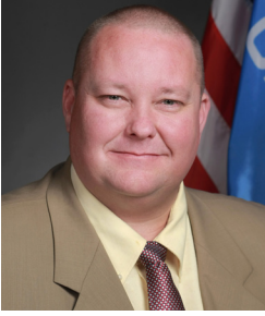
REPRESENTATIVE DELL KERBS