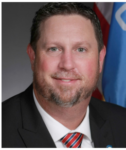
SENATOR DAVID BULLARD