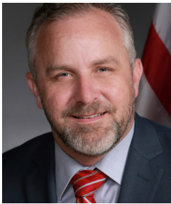
SENATE PRO TEM GREG TREAT