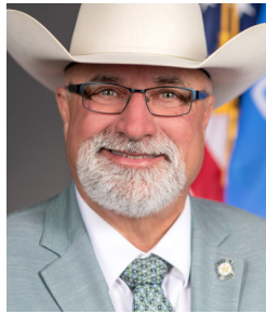
SENATOR BLAKE STEPHENS