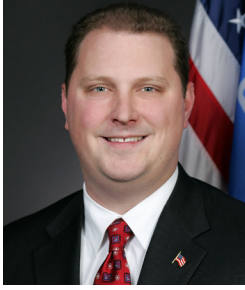
REPRESENTATIVE JON ECHOLS