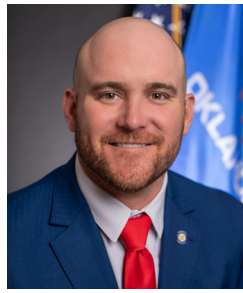
REPRESENTATIVE TREY CALDWELL